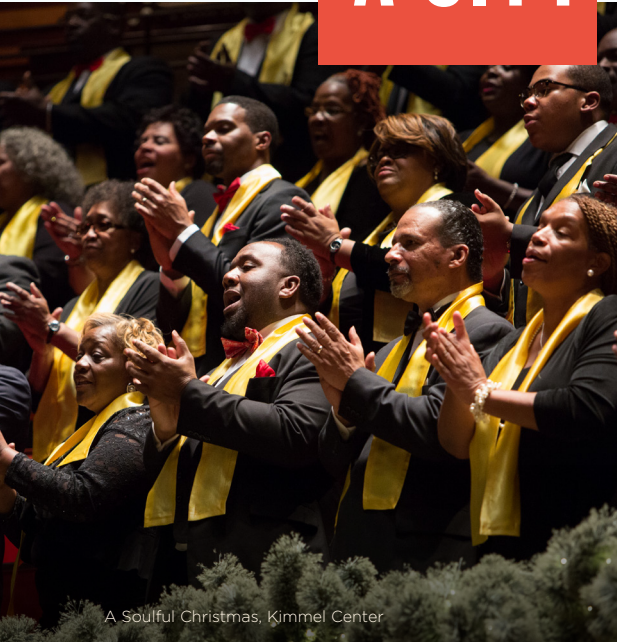
A Soulful Christmas, Kimmel Center